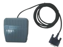
Foot Switch (External PTT) POA44