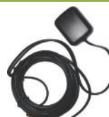
GPS Antenna (optional) GPS04