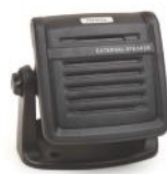
External Speaker Microphone SM09D1