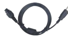
Programming Cable (USB Port) PC37